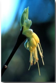
Flowers of Dirca spp.

Nyssa aquatica (water tupelo): This fast-growing tree from the swamps of the southeastern United States has received little attention from horticulturists. Propagation methods, genetics, and environmental stress resistances are being evaluated.