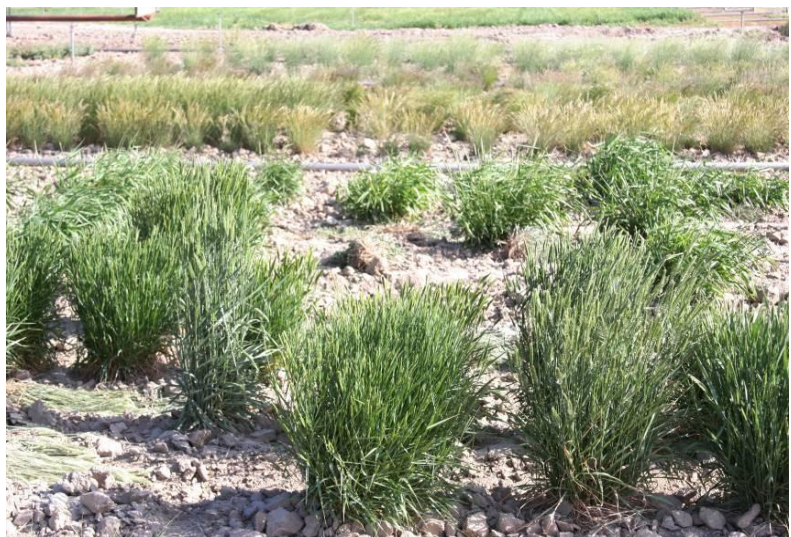
Grass species in the native plant evaluation plots at the Aberdeen R & E Center

Two difficult environmental factors were imposed on these plants. First, they were planted in a moderately heavy silt-loam soil with a high pH (8.2). Also, these established plots were irrigated with only 25 to 30% of the amount of water (based on evapotranspiration) typically used to maintain a Kentucky bluegrass lawn in SE Idaho. Depending on the year, five to eight inches of supplemental (above natural precipitation) water was applied to the plots over the period June to September. These conditions provide opportunity for selecting plants that can thrive in southern Idaho water-conserving gardens.