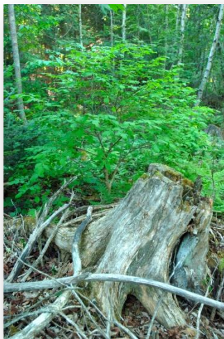
Shrub form of Dirca spp.